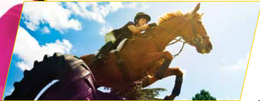
Play intramural and club sports with 9,500+ teammates.