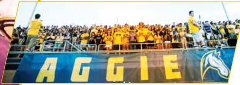
Share school spirit with 12,000+ Aggie Pack members.